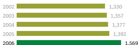
EBIT BEIA In millions of EUR