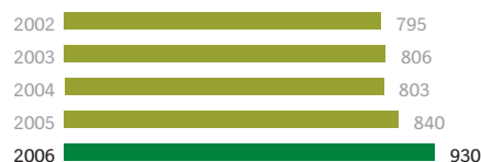
Net profit BEIA In millions of EUR